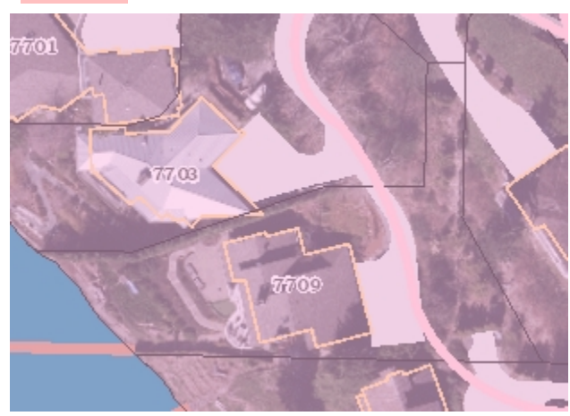
Wind Speed Up Values